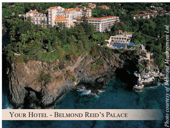
YOUR HOTEL - BELMOND REID'S PALACE

This winter, join Discover Europe on a remarkable journey into the heart of Madeira. With guided visits to the island’s legendary gardens as well as free time to explore, you’ll truly experience the full flavor of Portugal’s very own floating botanical paradise.