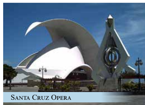
SANTA CRUZ OPERA

SATURDAY, MARCH 13 TH - A full day excursion today takes us around the northern part of the island, from the volcanic landscapes and mountain villages of the interior to the rugged coastline. Our first stop will be the village of Teror, an important religious center known for its beautiful basilica and well-preserved old quarter. We'll have time to admire the traditional wooden balconies and romantic corners of the village before continuing on to the mountain village of Tejeda. Upon arriving in Tejeda, we'll stop for a small snack or perhaps a traditional treat from the town's almond candy shop. Those who are up for a hike can head to Roque Nublo for an easy 1.5-hour trek to the fabled mountain, while those staying behind can eat more almond sweets and enjoy the fantastic mountain views, while waiting for the hikers to return. We then head to the picturesque fishing port of Puerto de las Nieves for lunch along the beautiful seafront promenade. We'll sit down to a delicious meal at one of the local fish tavernas and then have time to go swimming at the volcanic beach or natural salt water pools. We'll end the day in the fertile Valle de Agaete for a tour and tasting of unique Canarian coffee at a family-run coffee plantation. We'll learn how the local coffee is produced in a traditional way and enjoy a complimentary cup before returning to Las Palmas for a free evening. (B, L) OVERNIGHT: GRAN CANARIA