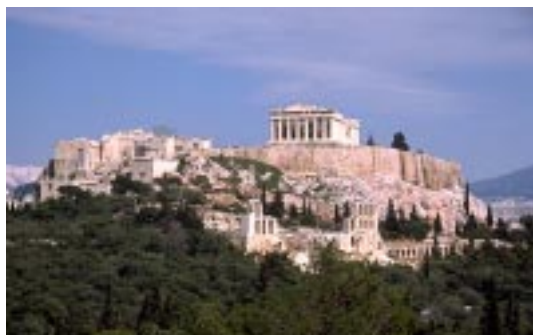
Athens - the Acropolis

The tour has been paced for comfort, with short travel times and the minimum number of one-night stays. There will be ample time for birding, sightseeing and shopping, or just sitting on the beach and doing nothing - as, for the poet Tennyson's Lotus Eaters, "it is a land in which it seemed always afternoon."