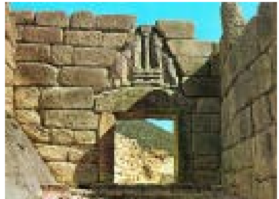
Mycenae - the Lion Gate

Day 10, Saturday May 1st. A final free day on the island of Apollo's birth before we take a late-afternoon flight back to Athens. We'll check in to our hotel and complete our tour with an evening of Greek food and music at a taverna in the Plaka. (B, D). Overnight: Athens