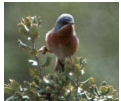
A Subalpine Warbler

Day 7, Wednesday April 28th. This morning we drive through the mountains down to Thebes, the setting for the story of Oedipus Rex. We'll arrive in Athens for an afternoon visit to the Acropolis. The main site of Classical Athens with its Temples and Museum provides wonderful views over the ancient center of the city. We continue to Athens airport to take our brief flight across the Aegean to the island of Lesbos. Time to relax and freshen up before dinner. (B, D). Overnight: Lesbos