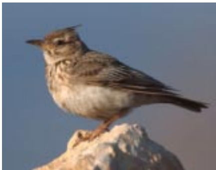
A Crested Lark

Key to included meals: B = Breakfast, L = Lunch, D = Dinner