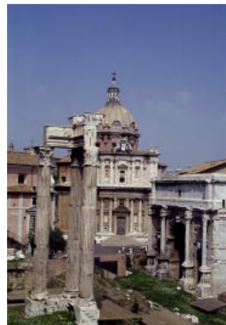
The Forum, Rome

Day 05, Monday 28 th April Overnight: Sorrento Today, an excursion to the island of Capri, one of the legendary beauty spots of the Mediterranean. Weather and tides permitting, we travel by local boat to the Blue Grotto, a cave bathed in an iridescent blue light. Free time to explore Marina Grande and to walk up the cobbled narrow street to Capri, the island's main town. Here there are spectacular views out over the bay towards the mainland and Mount Vesuvius. We return to Sorrento on an early afternoon boat with time to drive along part of the spectacular Amalfi Coast. The evening is free in Sorrento. (B)