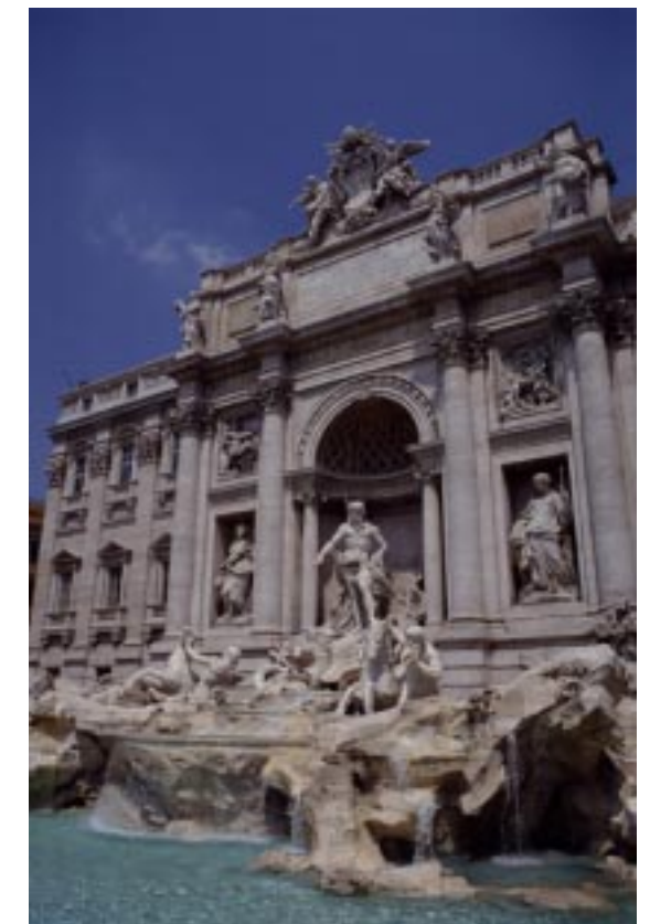
The Trevi Fountain, Rome