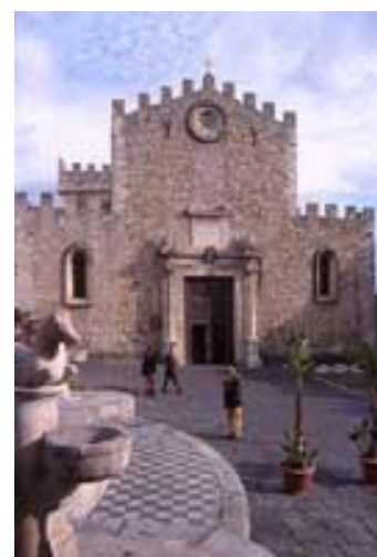
The Duomo, Taormina

Day 06, Tuesday 29 th April Overnight: Taormina An early start this morning at Pompeii, the extraordinarily preserved Roman city that was engulfed in ash from the eruption of Mount Vesuvius in AD79. A local guide will show us the highlights, including the House of the Faun and the House of the Vetti with their magnificent frescoes and mosaics. Free time for lunch and your own wanderings through the eerie streets before we make a prompt departure for the Railway station in Salerno, where we board the direct train to Taormina in Sicily. A late supper will be awaiting us at our hotel. (B, D)