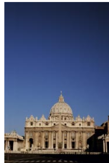
St. Peters, Rome

Discover Europe Ltd., Box 435, Dublin, NH 03444, USA Toll Free (866) 563-7077, Tel: (603) 563-7077, Fax: (603) 563-7137