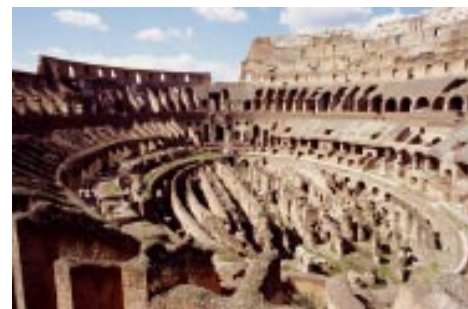
The Colosseum, Rome