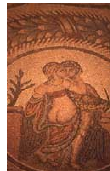
Mosaic, Villa Casale

Day 10, Saturday 3 rd May Overnight: Palermo Today we begin at the Valle dei Templi, just outside Agrigento on the south coast. A series of Doric temples strung out along a ridge facing the sea, these are easily the most captivating of the Sicilian Greek remains, and unique outside Greece. We continue west along the coast to the Greek city of Selinute, its mighty temples lying in great heaps, toppled by earthquakes. We'll visit both the east and west sites and also stop to explore the nearby quarries where the stone was excavated in the fifth century BC. We then take the fast motorway route to Palermo and our hotel on its outskirts. (B, D)