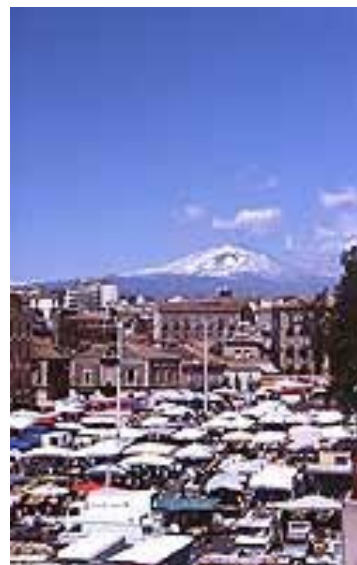
Mt. Etna, from Catania

Discover Europe reserves the right to substitute hotels of equal or superior standard should the above prove unavailable at the time of booking.