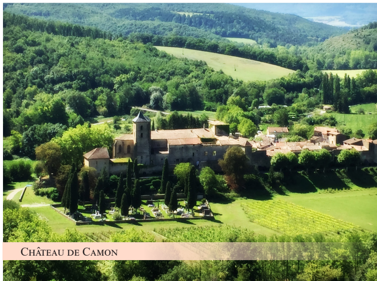
CHÂTEAU DE CAMON