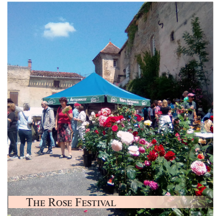
THE ROSE FESTIVAL