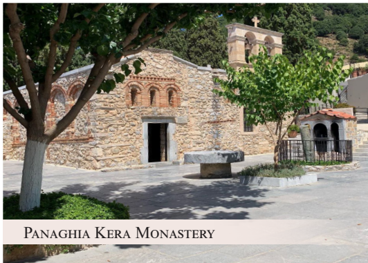
PANAGHIA KERA MONASTERY

This June, before the crowds of summer have arrived - and before the weather becomes paralyzingly hot - why not join us on this trip for family and friends to see these Ancient Islands .