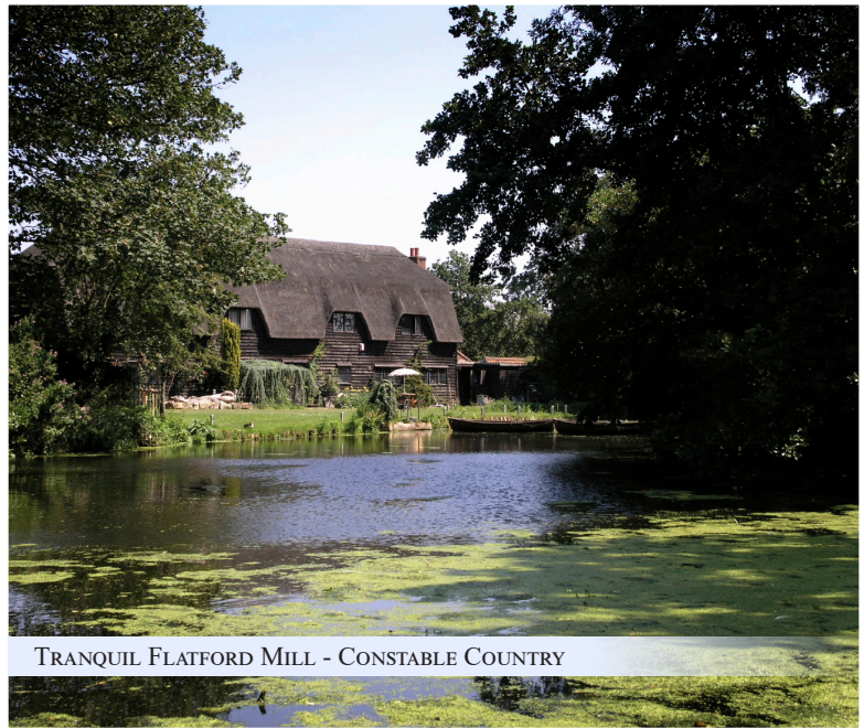
TRANQUIL FLATFORD MILL - CONSTABLE COUNTRY