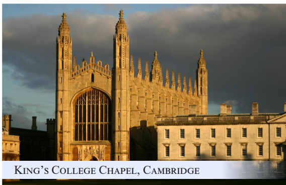
KING'S COLLEGE CHAPEL, CAMBRIDGE