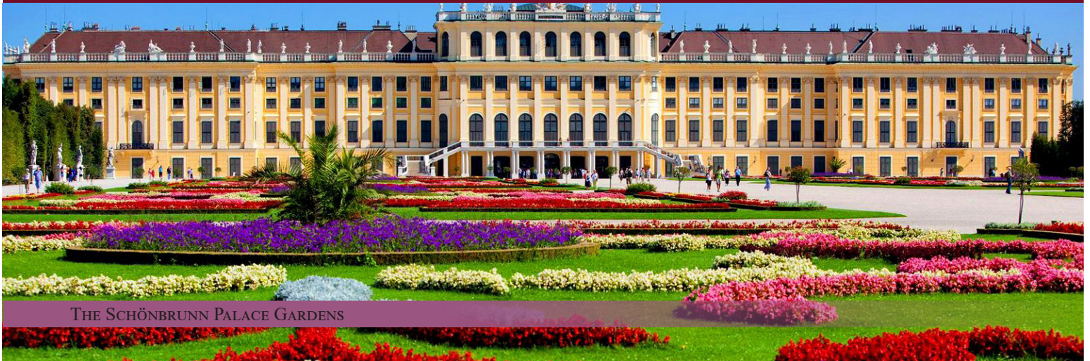
THE SCHÖNBRUNN PALACE GARDENS