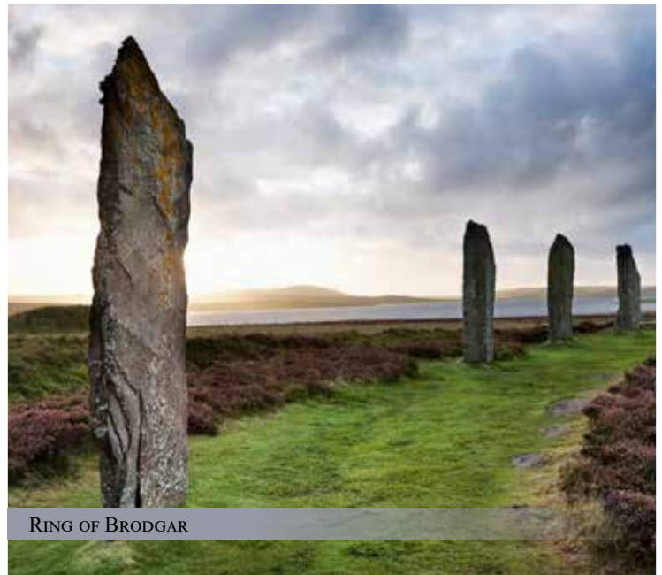
RING OF BRODGAR

Be part of the adventure with Discover Europe this year to the Orkney & Shetland Islands.