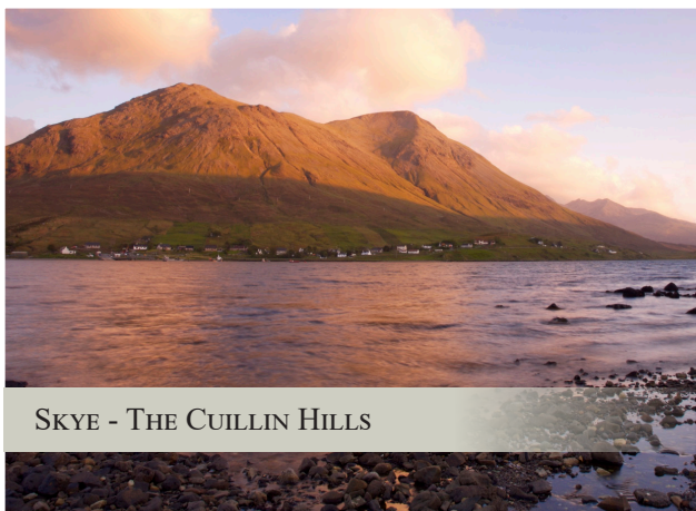
SKYE - THE CUILLIN HILLS

THURSDAY, SEPTEMBER 12 TH - A panorama of Skye today, with highlights that include a visit to Dunvegan Castle, the oldest inhabited castle in Britain and home to the Chiefs of MacLeod for more than 800 years. We’ll also visit the Talisker Whisky Distillery, the island’s only distillery. This evening is free in Portree. (B) OVERNIGHT: SKYE