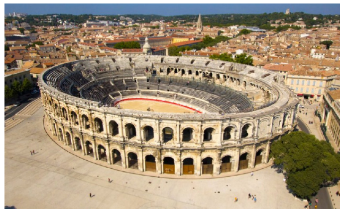
Arena de Nîmes