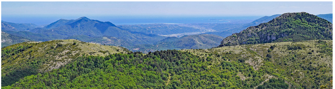
Breathtaking vistas of Southern France

Depart from Toulouse Airport back to the U.S. at any time. B