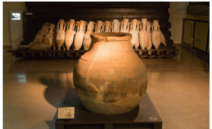
Dolium, Musée Archéologique Henri-Prades