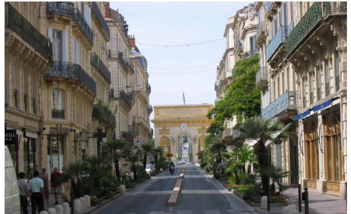
Streets of Montpellier

Head east from Montpellier into Provence where your first stop will be the Roman city of Nîmes. You take a walking tour and visit the beautifully preserved Roman Temple, Maison Cavée. Take some time to explore, have lunch on your own, and retire to the nearby Domaine de Poulvarel for a tasting of local Costire de Nîmes wines.