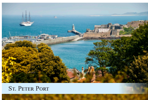
ST. PETER PORT

THURSDAY, SEPTEMBER 17 TH - This morning we'll discover more of Jersey's sites, including Mont Orgueil's medieval Gorey Castle, built in the 13 th century and surrounded by sea and cliffs, and the German Underground Hospital, a series of tunnels built by German forces. Lunch is included today and afterwards you'll have a free afternoon in the capital of St. Helier to explore the town's attractions and shops, which offer everything from lavender to high-quality jewelry, and at prices generally 15% less than found in the rest of Europe! You might also check out the Jersey Museum or Elizabeth Castle, built in the harbor by Sir Walter Raleigh. In the evening, you are free to sample a local restaurant—perhaps Season's for its beautiful décor and great food, or Bohemia, Jersey's only Michelin Star restaurant. (B, L) OVERNIGHT: JERSEY