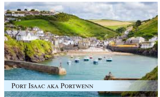
PORT ISAAC AKA PORTWENN

SUNDAY, SEPTEMBER 27 TH - Our excursion today to Land's End takes us through an area of ancient Celtic culture and outstanding natural beauty. Crystal-clear seas vie with the heather of the moors, and prehistoric stone circles are scattered over the Peninsula. We return to Penzance for a visit to the jewel in the crown of Mount's Bay: the island castle of St. Michael's Mount, possibly part of King Arthur's lost land of Lyonesse, with its 11 th -century monastery and 15 th -century fort. The evening is free to sample the restaurant of your choice. (B) OVERNIGHT: PENZANCE