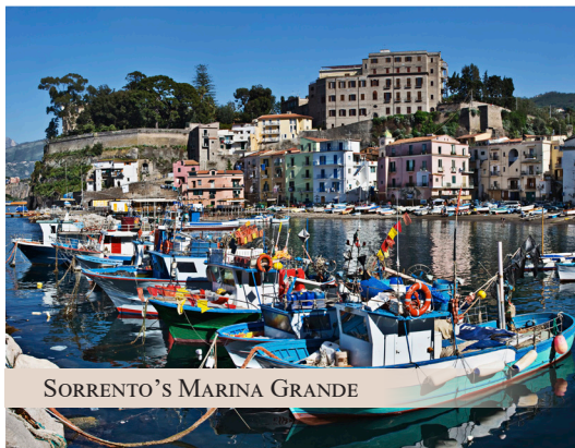
SORRENTO'S MARINA GRANDE

Your Discover Europe tour guide will lead you through scenic landscapes, ancient towns, and sculpture filled gardens on this discovery of southern Italy. Join us on Sorrento & the Amalfi Coast .