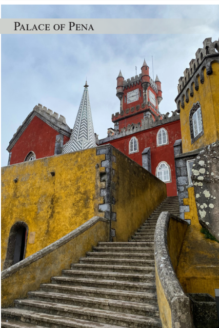
PALACE OF PENA

WEDNESDAY, OCTOBER 23 RD - We continue further south, along the border region, making a first stop at the extraordinary Jardim Episcopal in Castelo Branco. The garden's 18 th century layout is conventionally formal; its surprise lies in the many statues found throughout. The bishop's palace now houses a museum, which displays primitive art, 16 th century tapestries and a wide range of archaeological finds. Continuing our route south, we arrive at the medieval walled city of Evora which rises mysteriously from the Aletejan plain. Dinner is at our city center pousada this evening. (B, D) OVERNIGHT: EVORA