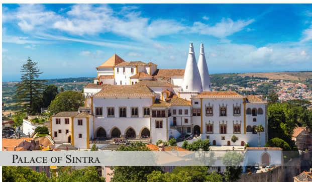
PALACE OF SINTRA

Join Discover Europe on an unforgettable sojourn into the very heart and soul of ancient Portugal.