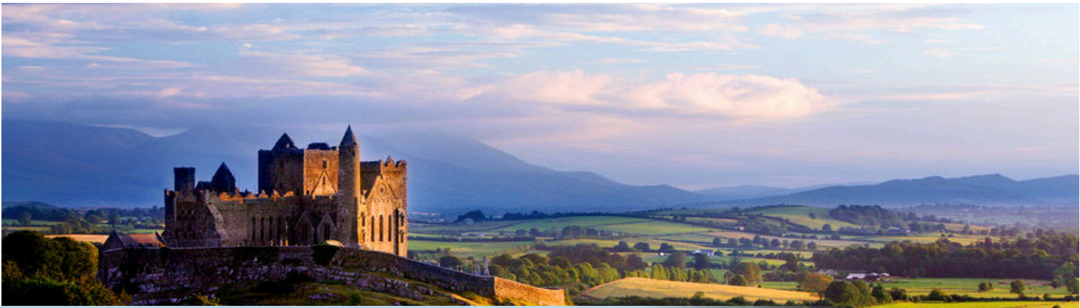
ROCK OF CASHEL