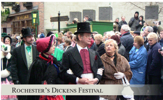
ROCHESTER'S DICKENS FESTIVAL

With a marvelous balance of guided touring and time to explore on your own, Discover Europe invites you to join us on an unforgettable, one-of-a-kind journey into the very heart of Dickensian England.