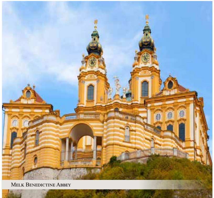
MELK BENEDICTINE ABBEY

THE COST OF THIS ITINERARY, PER PERSON, DOUBLE OCCUPANCY IS: