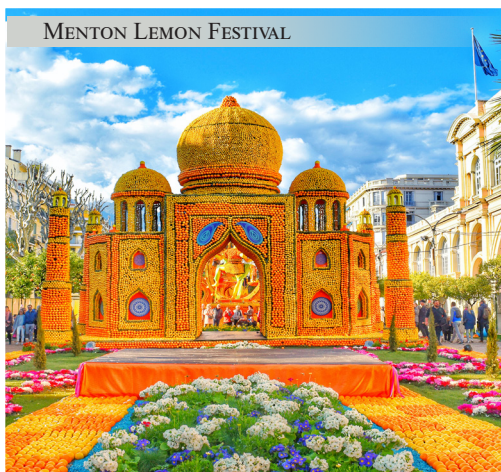
MENTON LEMON FESTIVAL