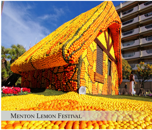
MENTON LEMON FESTIVAL

FRIDAY, FEBRUARY 24 TH - Heading east along the coast today - almost to the border with Italy - we reach the coastal town of Menton. We'll spend the day here marveling at the fantastic creations, all made from citrus fruits! There will be parades and events to attend and free time to explore the town - perhaps pay a visit to the Jean Cocteau Museum - before we return to Nice for our farewell dinner.