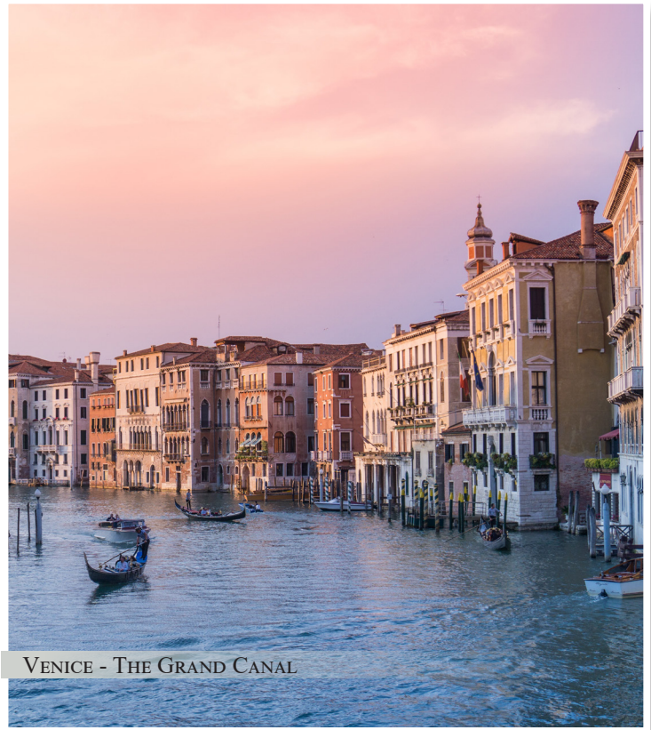
VENICE - THE GRAND CANAL