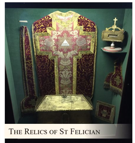
THE RELICS OF ST FELICIAN

P.S. If you feel so motivated, you can also contribute to the fund online by going to www.fondation-patrimoine.org . I have to warn you though, that this official site can be hard to navigate - even if your French is excellent! Please feel free to call if you need help.