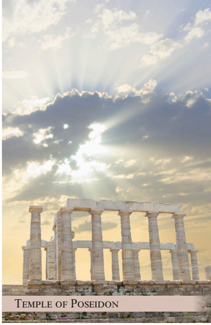
TEMPLE OF POSEIDON